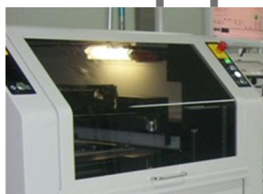
Full Automatic Printer