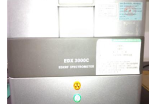
Energy Dispersive X Fluorescence