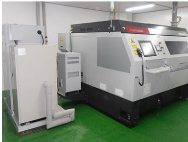
Mitsubishi Laser Drilling