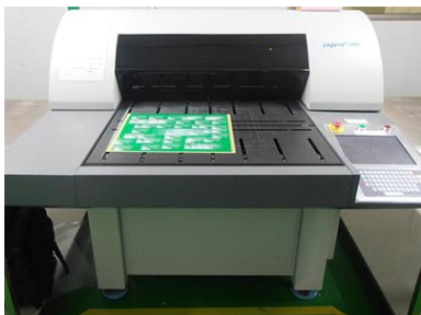
Orbotech Inkjet Printer