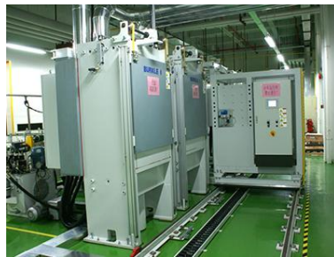
Boker Pressing Machine