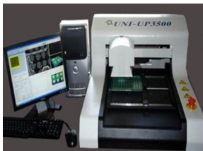
3D Solder Paste Thickness Gauge