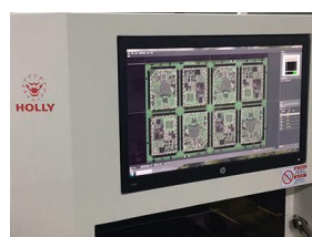
On Line AOI Inspection