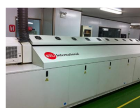
10 Temperature Zone LF Reflow Furnace